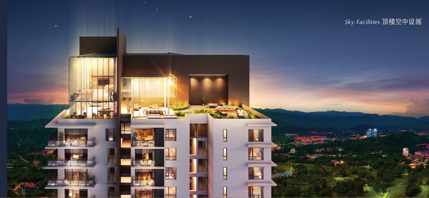
Sky Facilities 顶楼空中设施

Transportation 交通设施 Jesselton Point Ferry Terminal Kota Kinabalu International Airport